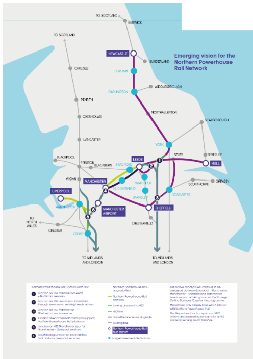
Fig 2: Emerging Northern Powerhouse Rail Network